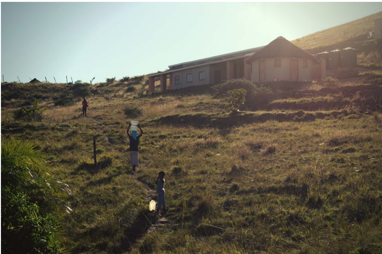
The newly painted Transcape Education Center in the beautiful winter landscape.

The classes take place within the old Education Center at Mdumbi Backpackers and the students are excited to move to the new Transcape Education Center that is being finalized.