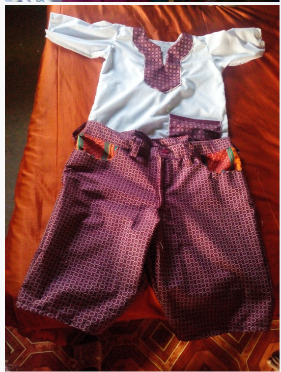
Sive's first achievement