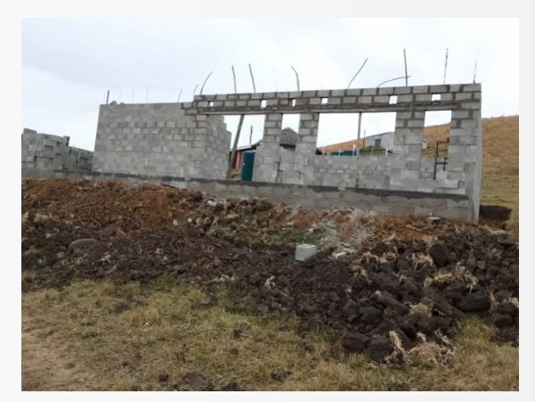
Skills Development Center so far

The last three months saw the beginning of the building, where the Skills Development is going to be housed. We managed to cast a strong foundation out of concrete and build the walls up to roof height. Between a group of Dutch Architects and our local builders, we were able to design and build half of the center already. We are busy fundraising for the completion of the building.