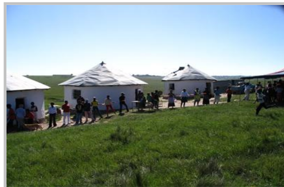
Rural Community Action