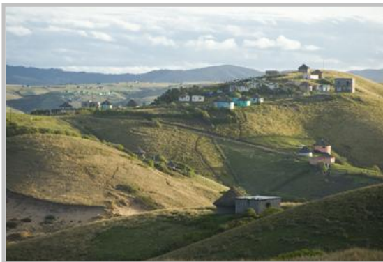
TransCape Non-Profit Organization

In 2006 a qualified teacher from Cape Town formed a partnership with TransCape to develop the education aspect of the organization.