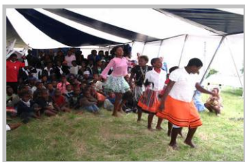
TransCape Non-Profit Organization